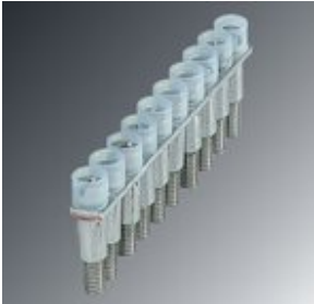
Fixed bridge, pitch: 6 mm, number of positions: 10, color: silver

Please be informed that the data shown in this PDF Document is generated from our Online Catalog. Please find the complete data in the user's documentation. Our General Terms of Use for Downloads are valid ( http://phoenixcontact.com/download )